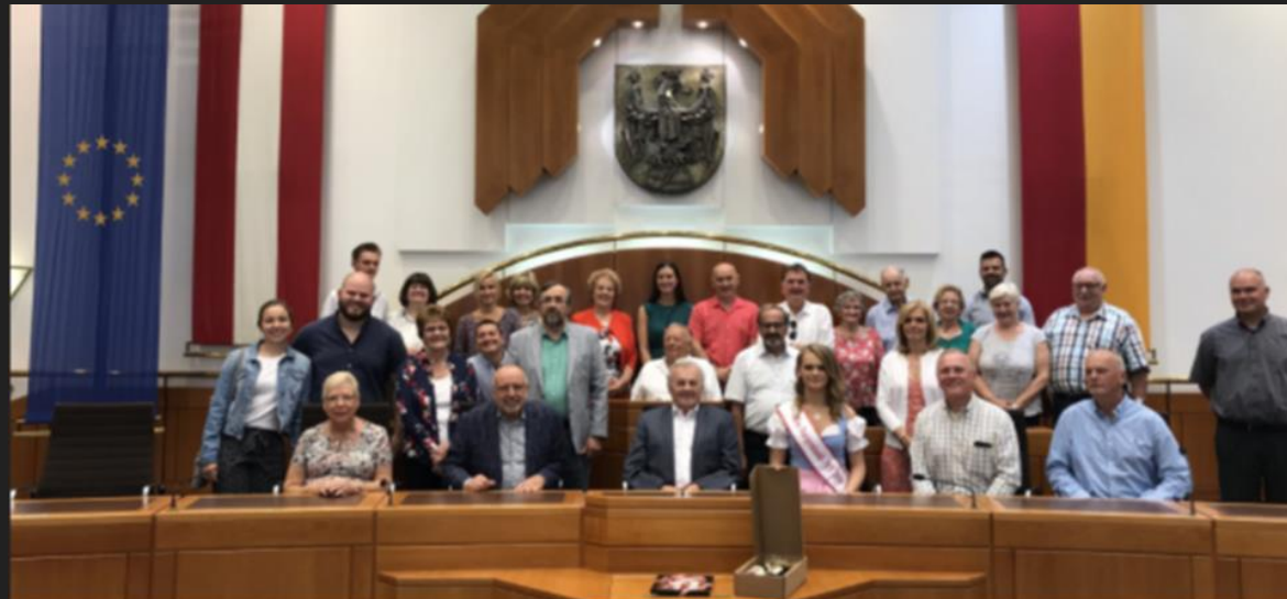
Die Auslandsburgenländer im Landtag